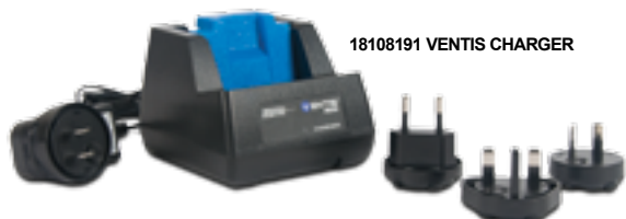
18108191 VENTIS CHARGER