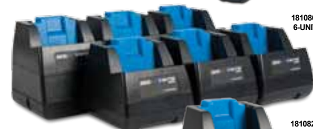
18108650-0 6-UNIT CHARGER