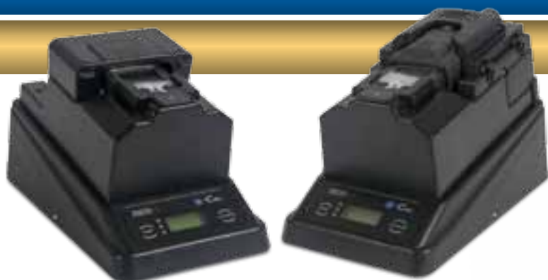
18108631-00 V-CAL WITH VENTIS INSTRUMENT* (*monitor not included)