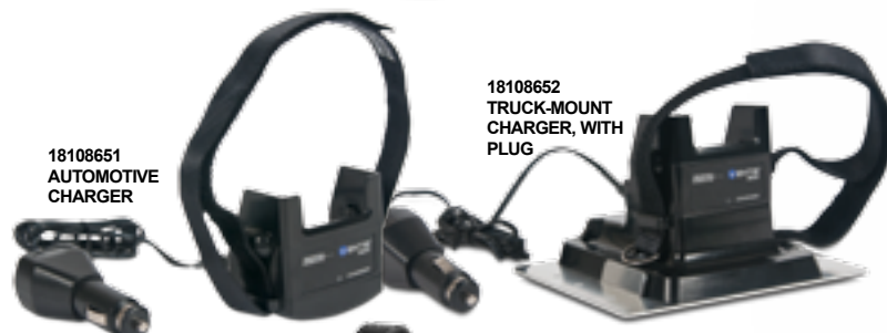
18108651 AUTOMOTIVE CHARGER