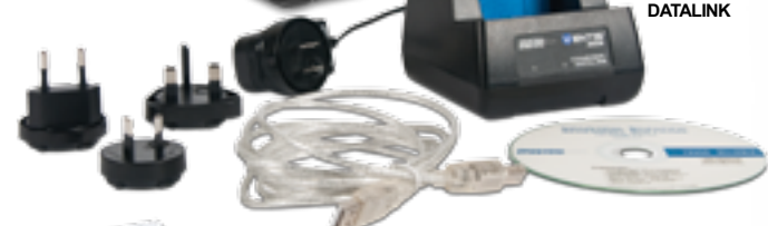
18108209 CHARGER/ DATALINK